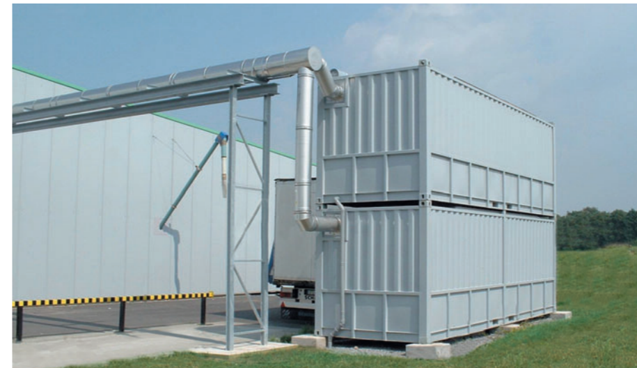
belflor® Biofilter Duo-boxed