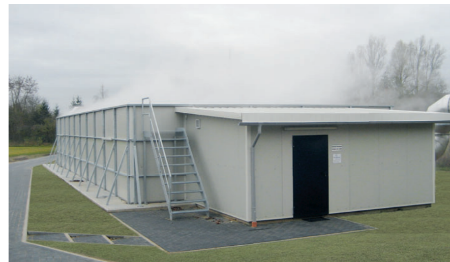
belflor® Biofilter open