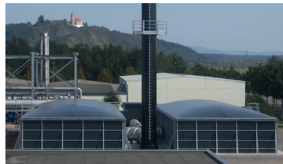
belflor® Biofilter Duo-case