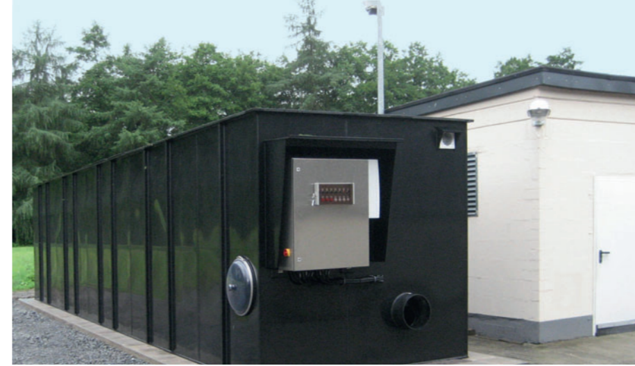
belflor® biofilter boxed